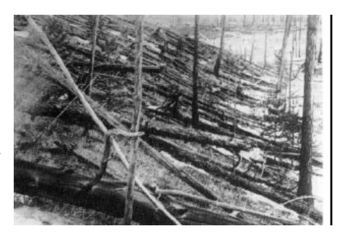
Figure 1: Trees leveled by the Tunguska explosion. This photo appears to originate with the first expedition to the site, led by L. A. Kulik of the Russian Academy of Sciences in 1927.

A descending fireball, brighter than the sun, exploded over a sparsely populated area in the Tunguska region of Siberia on June 30, 1908.<sup>2</sup> Over 300,000 acres of pine forest were leveled in an instant. The explosion was heard over 600 miles away. The trees were later found to be snapped off and pointing radially away from the center of the blast (Figure 1), except at the center of the impact, were no trace of the original forest remained.