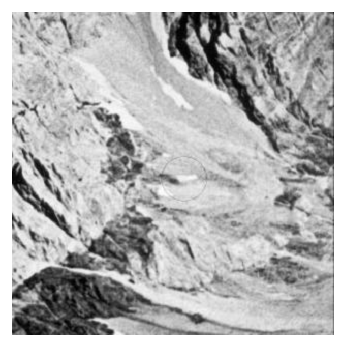
Figure 1: Is this Noah's ark?

Well, of course. What else should one expect with Biblical chronology shortened a full thousand